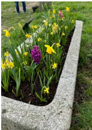
Above: The horse trough in the Meadow was replanted with bulbs by a mystery resident: thank you!